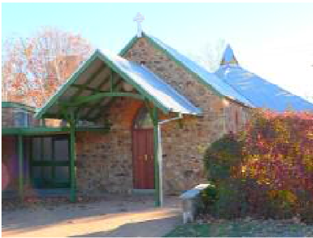
A beautiful historic church – warm and welcoming