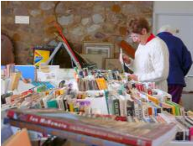
Regular book sales