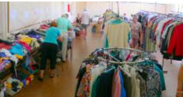
Regular clothing sales